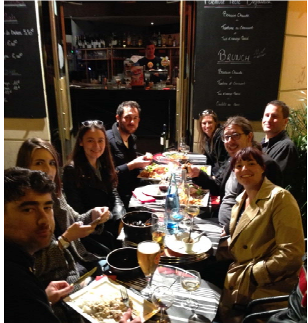
YPF, YPP USA and YPAC members at a dinner in a typical Parisian brasserie.

Overall it was a great experience and I felt privileged to be there. One of the practices that I would like to borrow from YPF is to send a group delegation of YPAC members to conferences like this followed by a tour of various facilities in the area. I will be pursuing this idea further with the YPAC Executive Committee and Advisory Board. Hopefully we will be able to implement it in time for the IPC2016.